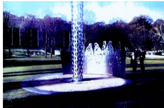
Artist's impression of the future Bomber Command Memorial Credit: Department of Defence

The Bomber Command Memorial will be a very dramatic sculpture, located prominently in the grounds of the Australian War Memorial. It will be one of the first commemorative elements encountered by most visitors as they walk from their cars to the main entrance to the Memorial. It will also be illuminated at night, and very visible from the major traffic routes that pass the Australian War Memorial.